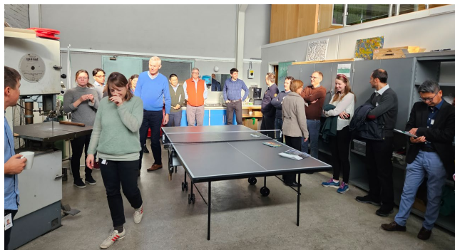
Workshop participants in the SmartForest facilities at NIBIO.

The first BioCarbUpgrade workshop and SC meeting was arranged at Ås on 16-17 October 2023. In the meeting, the project and its activities were presented and discussed. The meeting was hosted by NIBIO, who also arranged a tour of their facilities.