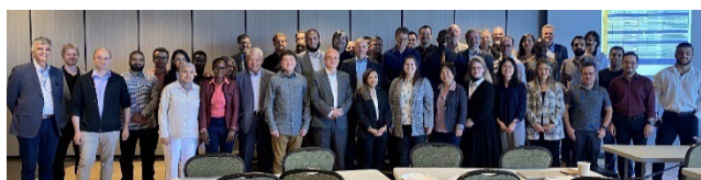
Participants at the CaNAI Summer School 2023