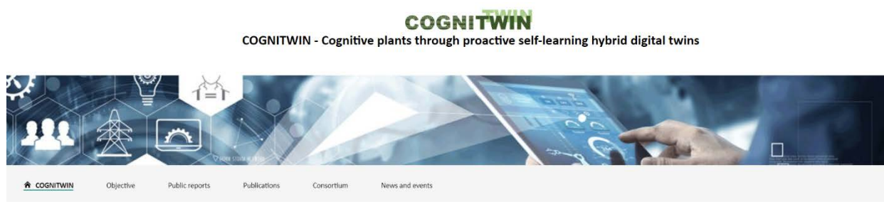
Figure 1 presents a screenshot of the COGNITWIN website main page.