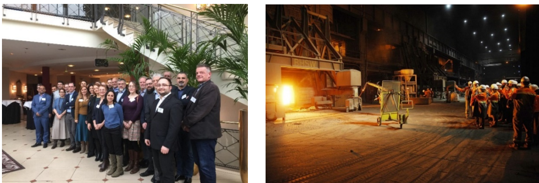
Figure 3: COGNITWIN consortium during M6 project meeting and industrial site visit of Saarstahl