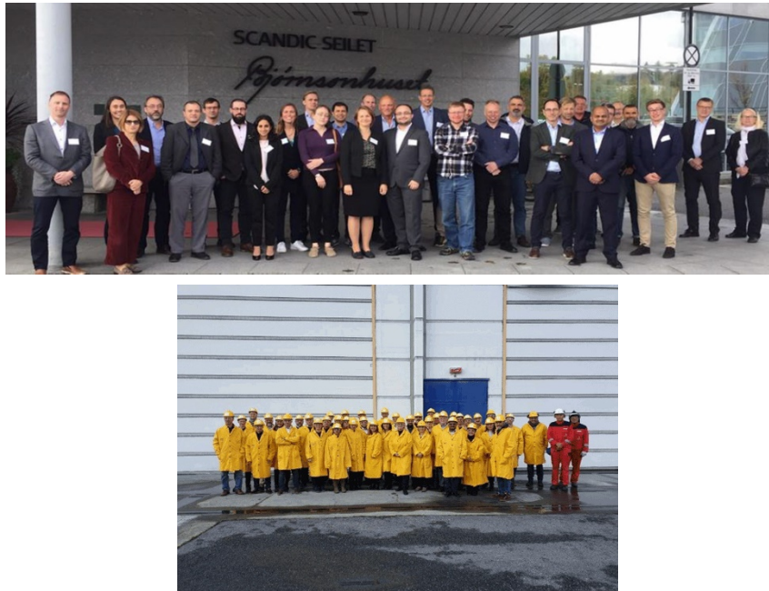
Figure 2: COGNITWIN consortium during the kick-off meeting and industrial site visit of Hydro Aluminum.

COGNITWIN kick-off meeting was held in Molde (Norway) from October 1 st -3 rd , 2019. In total, 45 participants from all the 14 partners attended the meeting. On the second day of the meeting, the participants have visited an industrial plant of Hydro Aluminum (Sunndalsøra). Pictures from the kick-off meeting are presented in Figure 2.