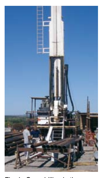
Fig. 4: Core drilling in the Sulcis basin

Moreover, as end-user of the European project MOVECBM, Carbosulcis has recently started a project entitled "Coalbed methane and enhanced coal-bed methane (CBM/ ECBM) recovery and CO, geological storage performance assessment at the Sulcis Basin" in collaboration with BRGM. IFP, Imperial College, OGS,