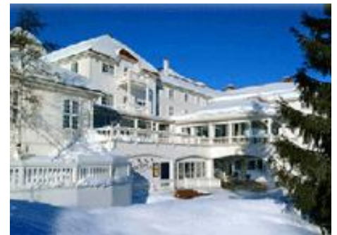
Dr. Holms Hotel