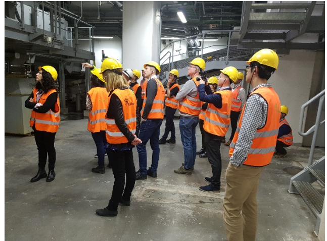
Participants at the GrateCFD event, visiting the Returkraft WtE plant

The fifth GrateCFD workshop and steering committee meeting were arranged in Kristiansand in November 2019 at the Returkraft WtE plant. In the workshop also this time selected topics of special interest to the industry were presented and discussed, as a basis for the further work and prioritizing of activities and simulations to be carried out. The program included a site visit at the Returkraft plant.