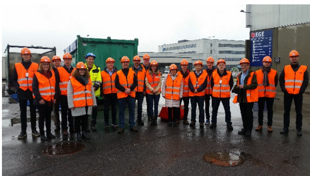
Participants at the open workshop, visiting the EGE Oslo Haraldrud WtE plant