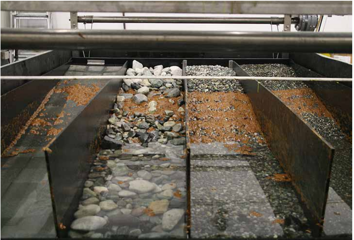
Bioremediation studies in meso-scale basin.